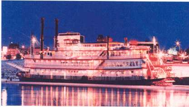
Sioux City, IA