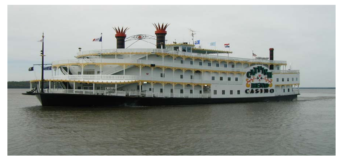
Fort Madison, IA (Summer) Burlington, IA (Winter)