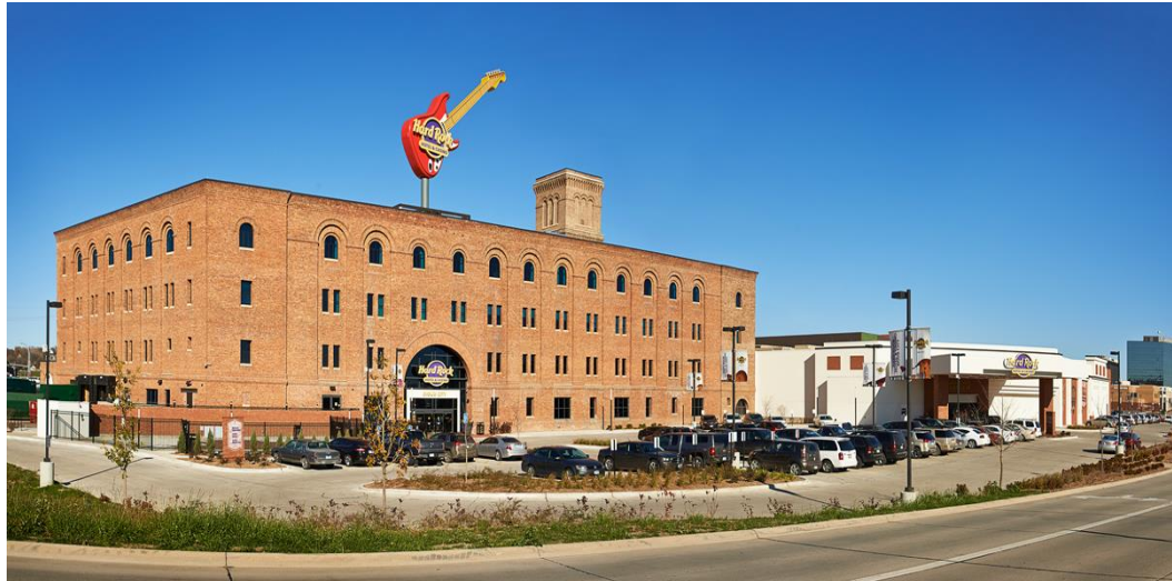
Sioux City, IA